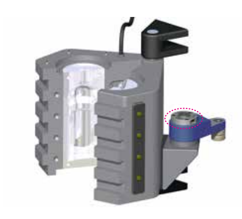
Fastening the lever arm by means of ETP® locking bushes provides for quick readjustment and minimum downtimes.